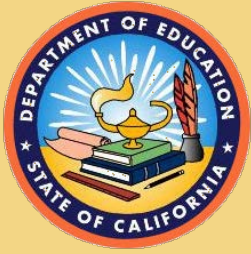
Tom Torlakson State Superintendent of Public Instruction